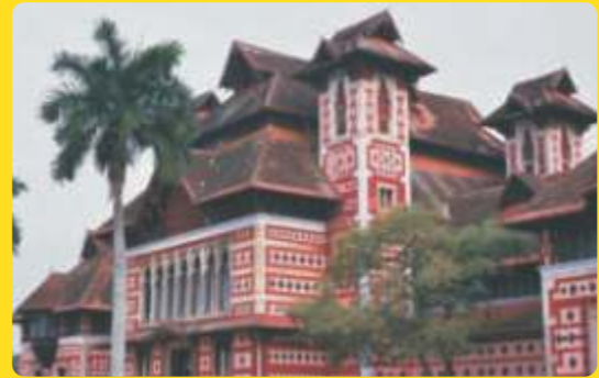
MUSEUM- 13 KM