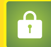
Gated community with Round the clock security