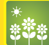
Ambient and elegant entry