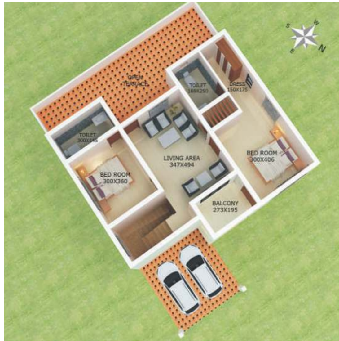
FIRST FLOOR 896 Sq. Ft