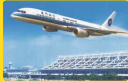
AIRPORT - 15 KM