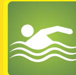
Swimming pool with separate toddlers pool