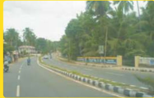
FROM MC ROAD - 2 KM