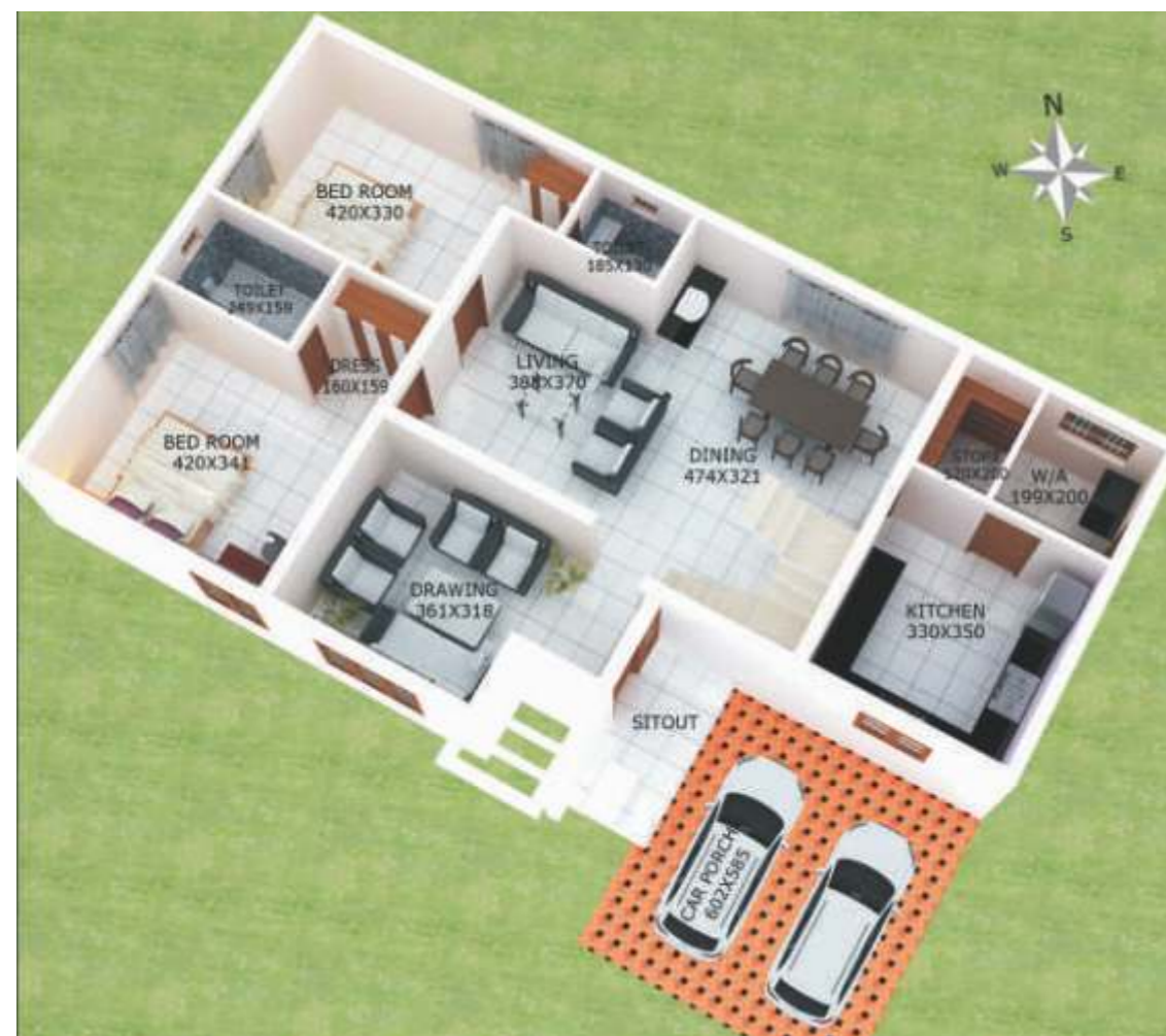
GROUND FLOOR 1789.54 Sq. Ft