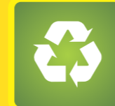
Effective garbage management system