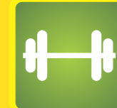
Multigym with imported equipments