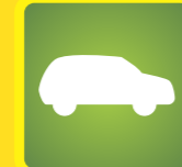
Guest car parking area