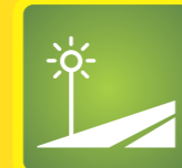
Well laid out wide internal road with lighting