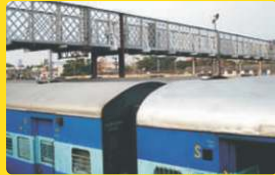
RAILWAY STATION - 14 KM