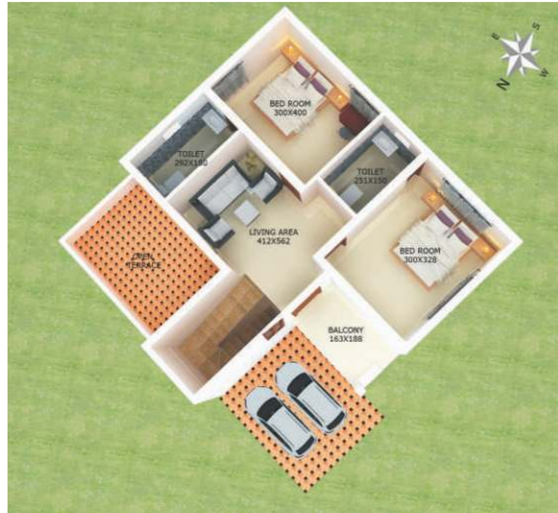
FIRST FLOOR 800 Sq. Ft