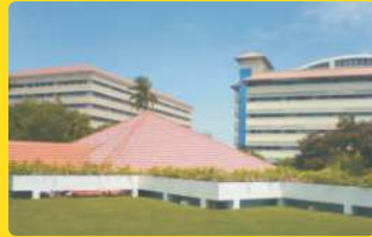
TECHNOPARK - 11 KM

Located near Mar Ivanios College, Vattappara and just 2 km from MC Road, 5 km from St. Thomas School and 11 km from Technopark, well connected with Highways, Railway and Airport, close proximity to many prestigious Educational Institutions, Hospitals and Shopping Areas makes KBD Daffodils a premium home for you and your family.