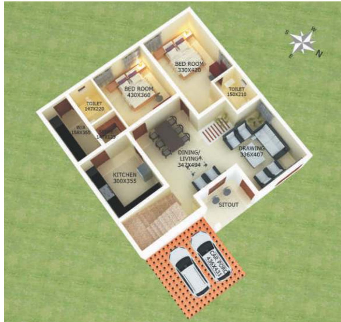
GROUND FLOOR 1478Sq. Ft

Daffodils LUXURY VILLAS & APARTMENTS @ THIRUVANANTHAPURAM