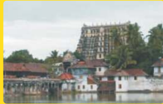
PADMANABHA SWAMI TEMPLE - 15 KM