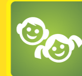
Children's play area with equipment