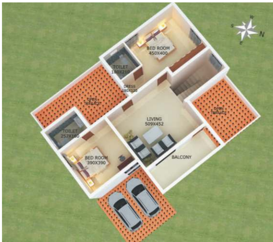
FIRST FLOOR 1036 Sq. Ft