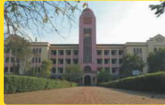
MAR IVANIOS COLLEGE - 7 KM