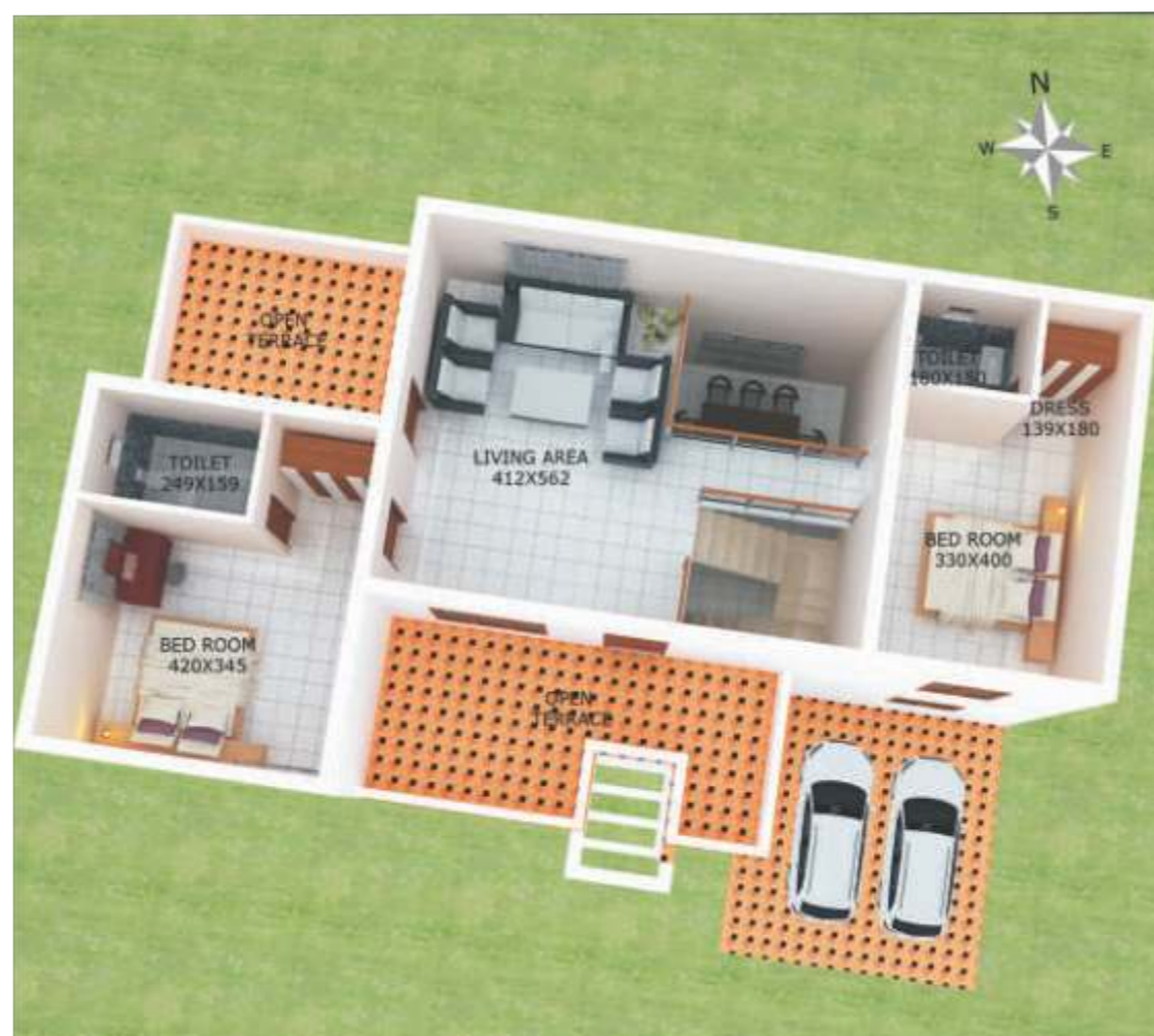
FIRST FLOOR 958.1 Sq. Ft