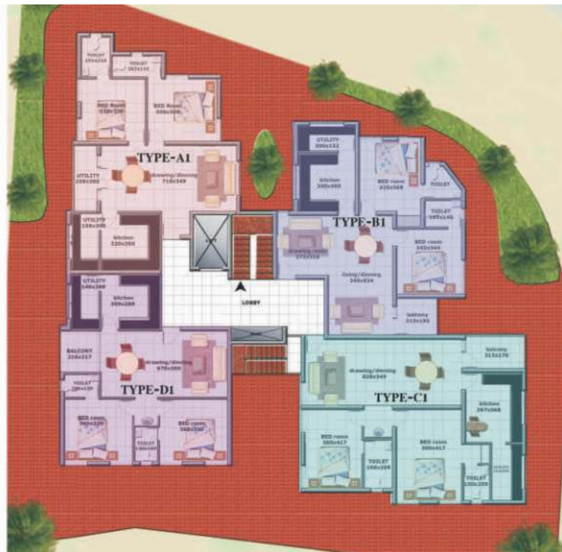
APARTMENTS | FIRST TO THIRD FLOOR