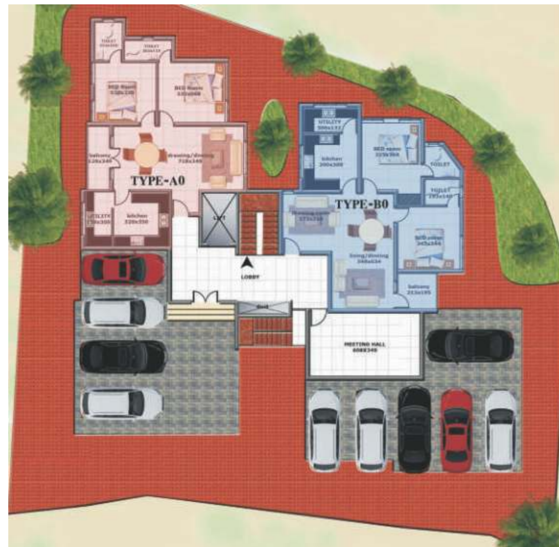
APARTMENTS | GROUND FLOOR