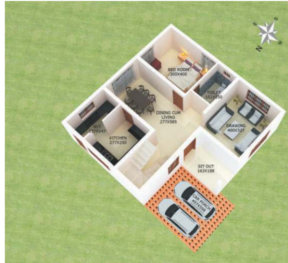
GROUND FLOOR 1203 Sq. Ft

Daffodils LUXURY VILLAS & APARTMENTS @ THIRUVANANTHAPURAM